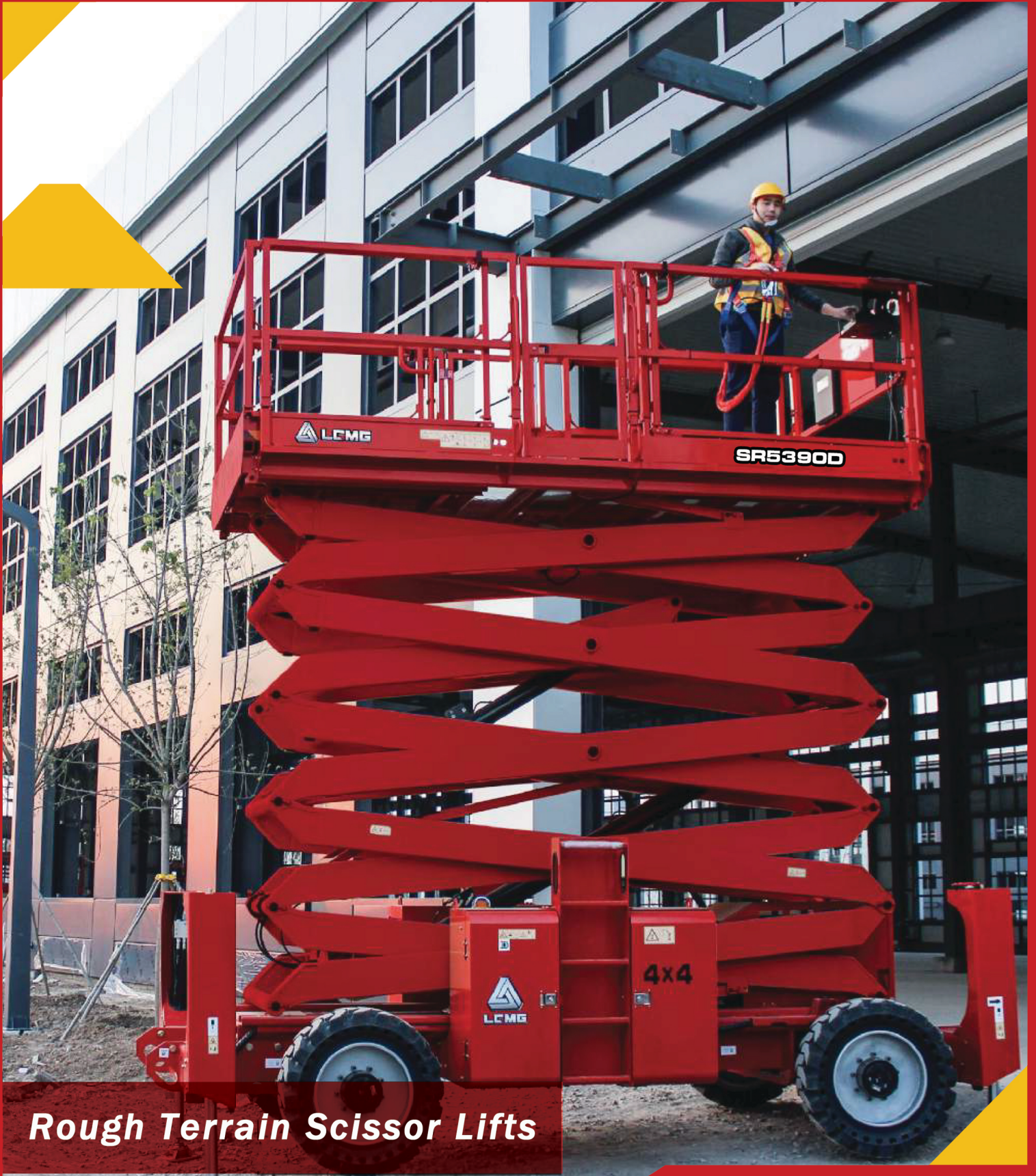
Rough Terrain Scissor Lifts